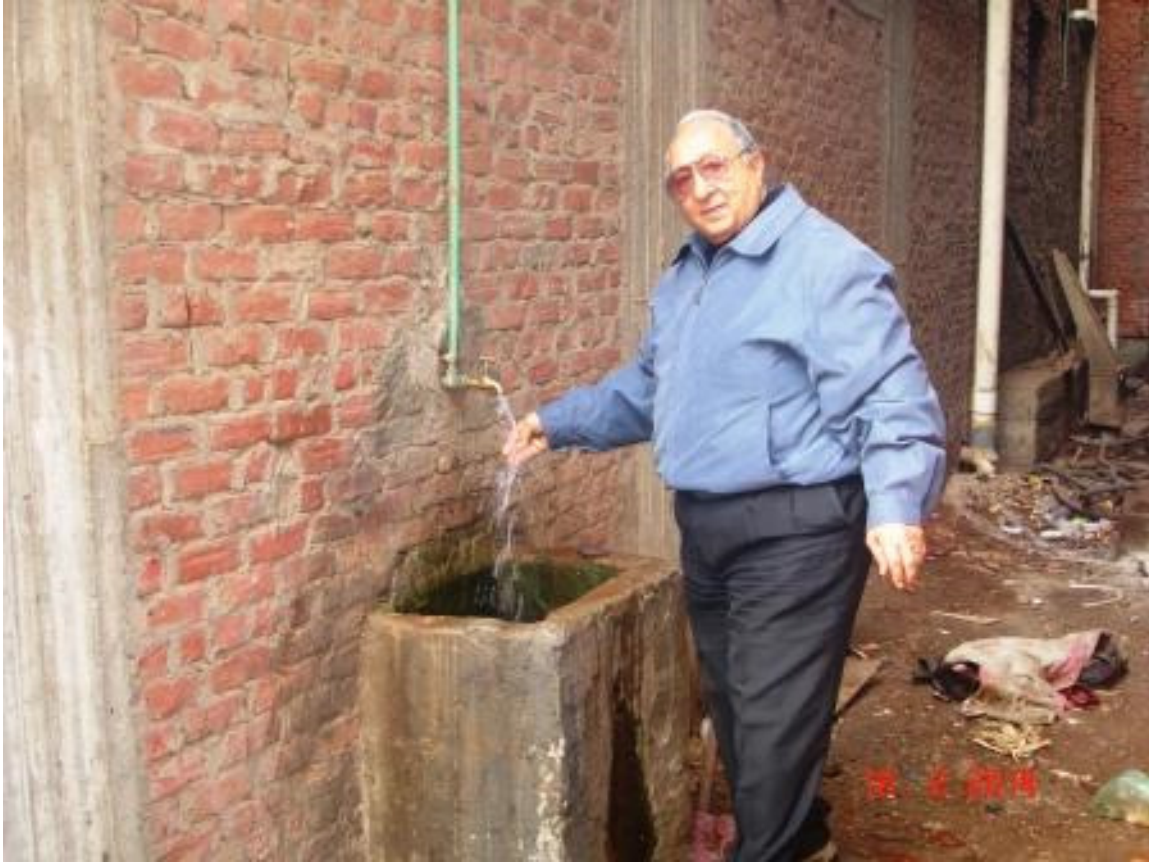
Here the tapes to any place inside