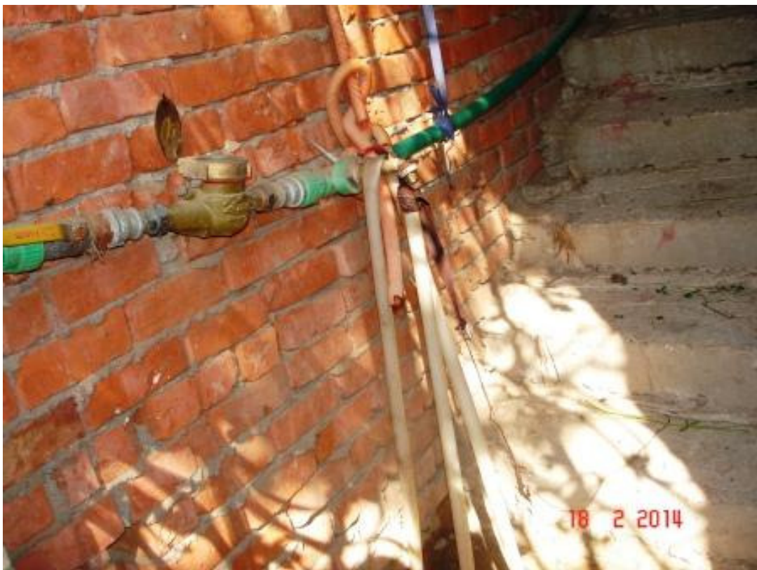
Another water meter to the first and second flour