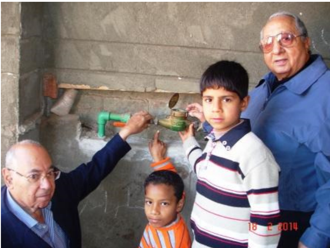
THE inhabitants insert their water meter and start to get clean drinking water the first time since 30 years and the children's are very happy