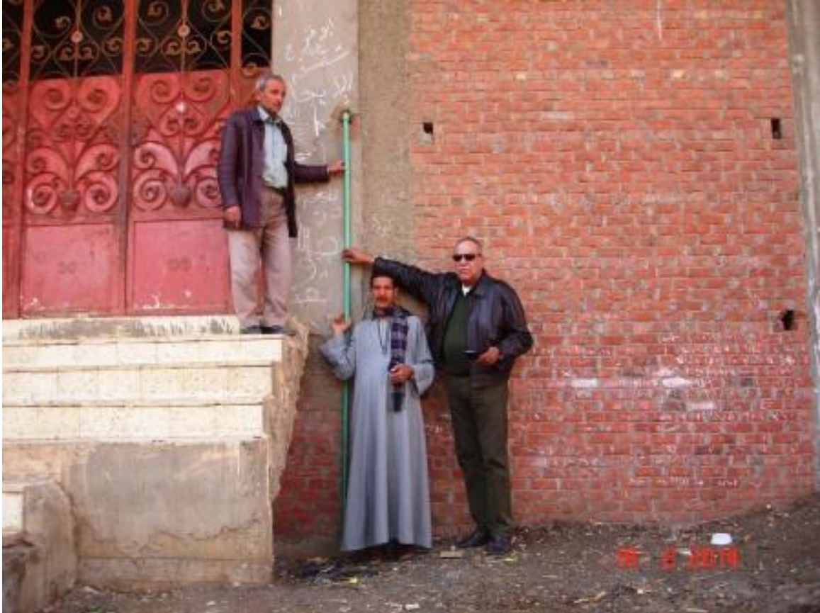
Our engineer rotary horus show the attached tube to inside home