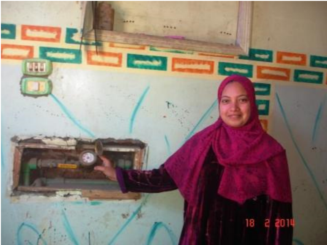
Water meter in another home and the lady also very happy