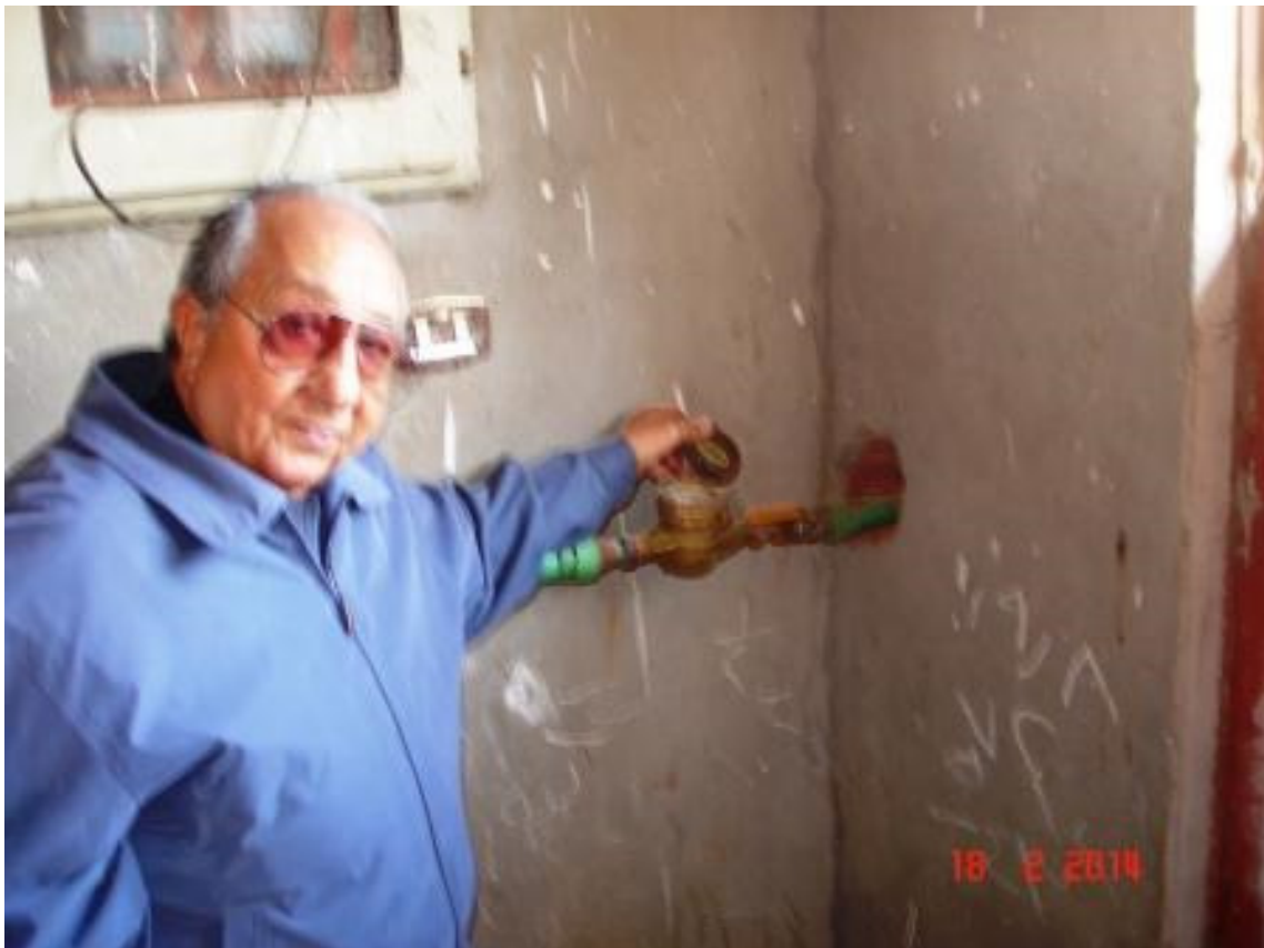
P.Rc horus show water meter