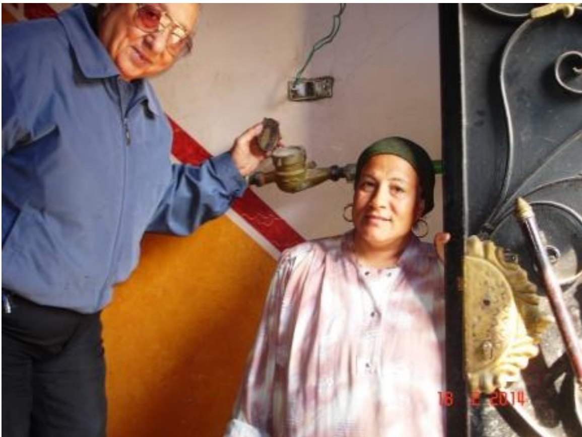
The hose here three floors and the woman in the third floor is very happy