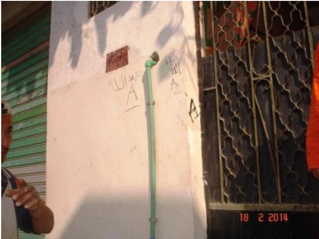
The tubes inside homes